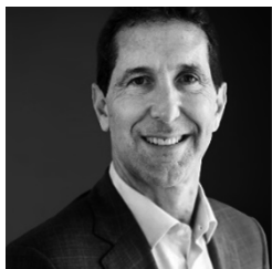
Independent director and Board Chair