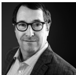
President and CEO of Accord and a non-independent director